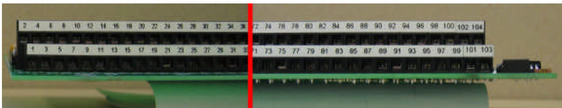
Figure 2- Rev C Orientation

Because of this, the white numeric labels on the bottom row terminals have been shifted by two. The PCB silkscreen remains the same.